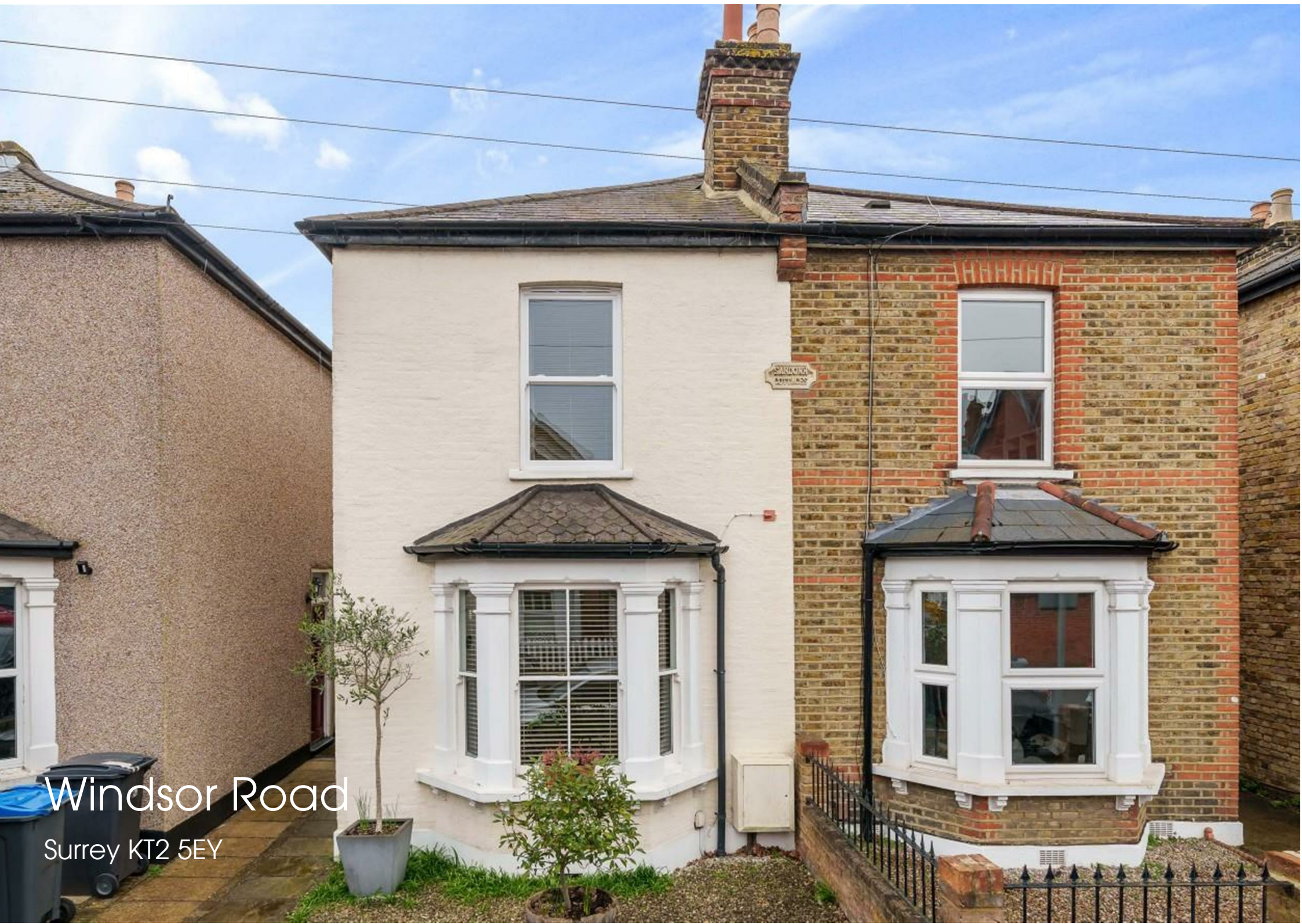
Windsor Road Surrey KT2 5EY

34 Richmond Road Kingston upon Thames Surrey KT2 5ED www.gibsonlane.co.uk Tel: 020 8546 5444